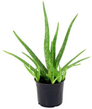
SHIPPED IN A 5.5-INCH POT. PLANT SIZE MAY VARY BASED ON GROWING CONDITIONS.

Note: Some leaves may appear wilted or yellow upon arrival. This is due to the stress of shipping and is nothing to worry about. Water the plant and let it recover in a shady location for a few days, then gently remove any foliage that does not recover to allow for new growth.