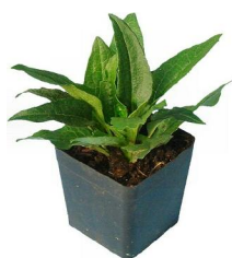
SHIPPED AS SHOWN

The foliage on potted plants may appear slightly wilted or yellow upon arrival. This is due to the stress of shipping and is usually nothing to worry about. Water the plant thoroughly, place it in a shady location for a few days and remove any foliage that does not recover.