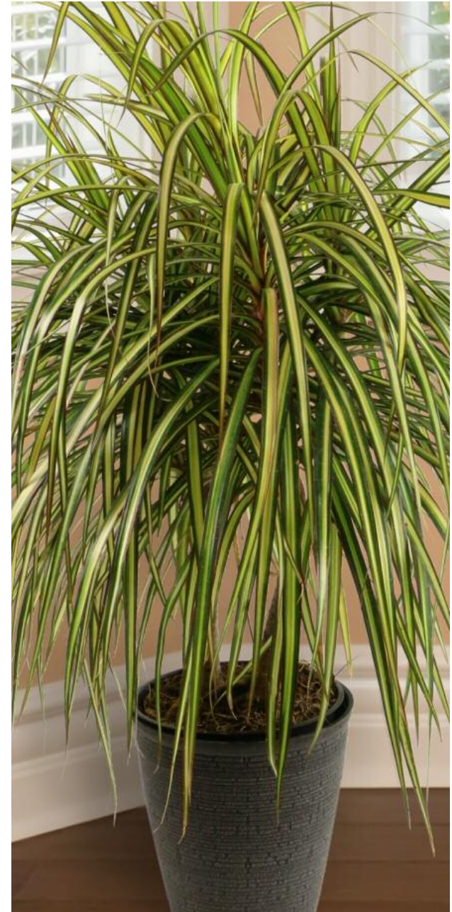
*Image on cover is representative of the type of plant(s) in this offer and not necessarily indicative of actual size or color for the included variety.