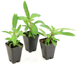
SHIPPED IN 2.5-INCH POTS. PLANT SIZE MAY VARY BASED ON GROWING CONDITIONS.

Note: Some leaves may appear wilted or yellow upon arrival. This is due to the stress of shipping and is nothing to worry about. Water the plant and let it recover in a shady location for a few days, then gently remove any foliage that does not recover to allow for new growth.