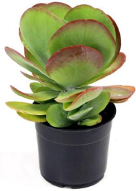
SHIPPED IN A 5.5-INCH POT. PLANT SIZE MAY VARY BASED ON GROWING CONDITIONS.

Note: Some leaves may appear wilted or yellow upon arrival. This is due to the stress of shipping and is nothing to worry about. Water the plant and let it recover in a shady location for a few days, then gently remove any foliage that does not recover to allow for new growth.