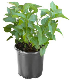
SHIPPED AS SHOWN

The foliage on potted plants may appear slightly wilted or yellow upon arrival. This is due to the stress of shipping and is usually nothing to worry about. Water the plant thoroughly, place it in a shady location for a few days and remove any foliage that does not recover.