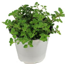
SHIPPED AS SHOWN

The foliage on potted plants may appear slightly wilted or yellow upon arrival. This is due to the stress of shipping and is usually nothing to worry about. Water the plant thoroughly, place it in a shady location for a few days and remove any foliage that does not recover.