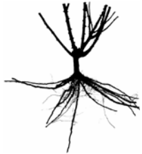
SHIPPED AS A BARE ROOT PLANT

Note: The roots of your bare root rose are coated with Terra-Sorb® Hydrogel to protect them from drying out during handling and transport. It is suitable for planting and should be left on the roots at planting time.