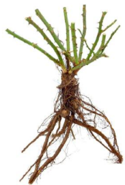
SHIPPED IN BARE ROOT FORM.

Note: The roots of your bare root plant are coated with Terra-Sorb® Hydrogel to protect them from drying out during handling and transport. It is suitable for planting and should be left on the roots at planting time.