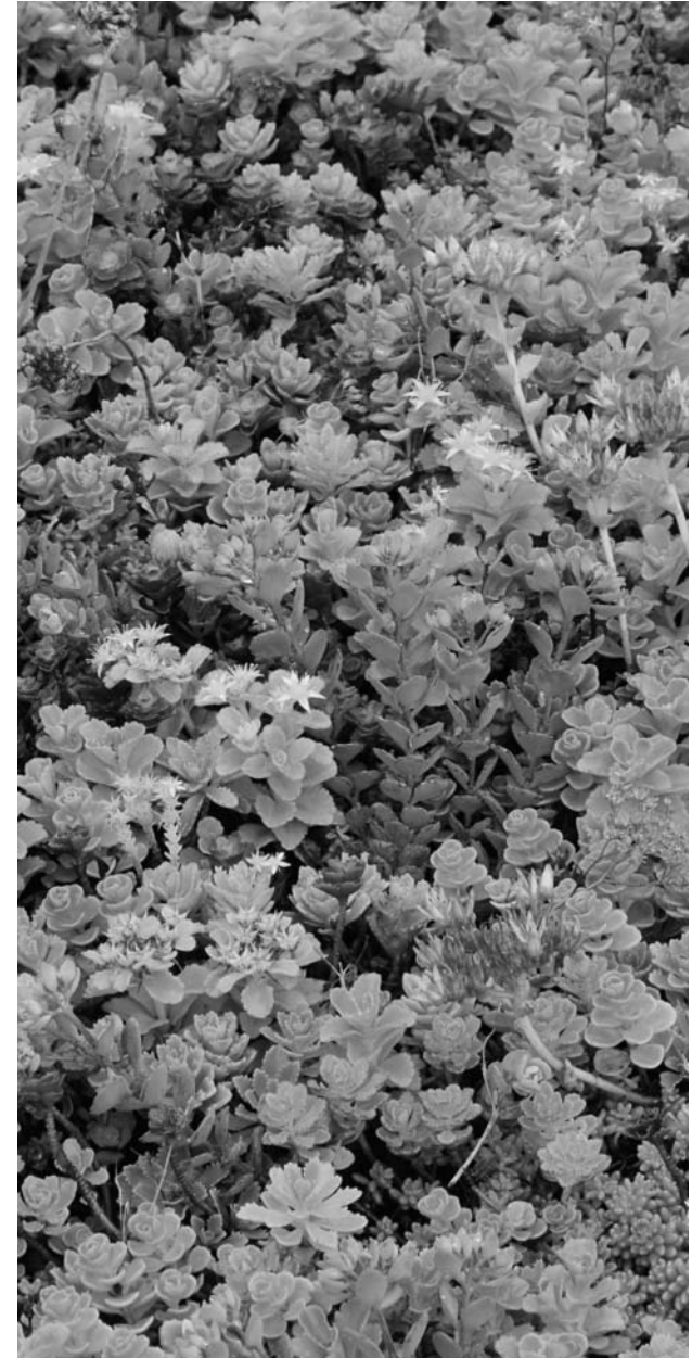
*Image on cover is representative of the type of plant(s) in this offer and not necessarily indicative of actual size or color for the included variety.