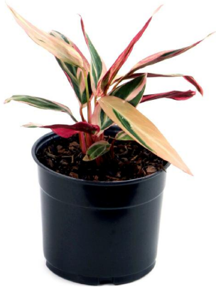
SHIPPED AS SHOWN

Note: Some leaves may appear wilted or yellow upon arrival. This is due to the stress of shipping and is nothing to worry about. Water the plant and let it recover in a shady location for a few days, then gently remove any foliage that does not recover to allow for new growth.