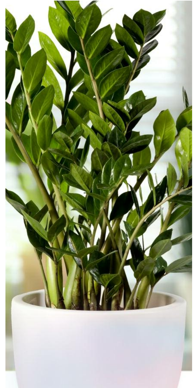
*Image on cover is representative of the type of plant(s) in this offer and not necessarily indicative of actual size or color for the included variety.