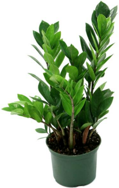
SHIPPED AS SHOWN

Note: Some leaves may appear wilted or yellow upon arrival. This is due to the stress of shipping and is nothing to worry about. Water the plant and let it recover in a shady location for a few days, then gently remove any foliage that does not recover to allow for new growth.